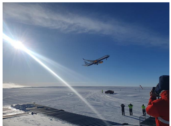
The plane which took us to Neumayer from Troll