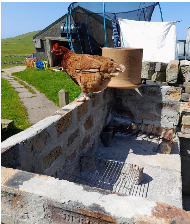
CAPTION COMPETITION Spotted at Houll this week, this very brave/stupid hen hopped up on to Guillermo's barbecue, fancy putting a caption to it?