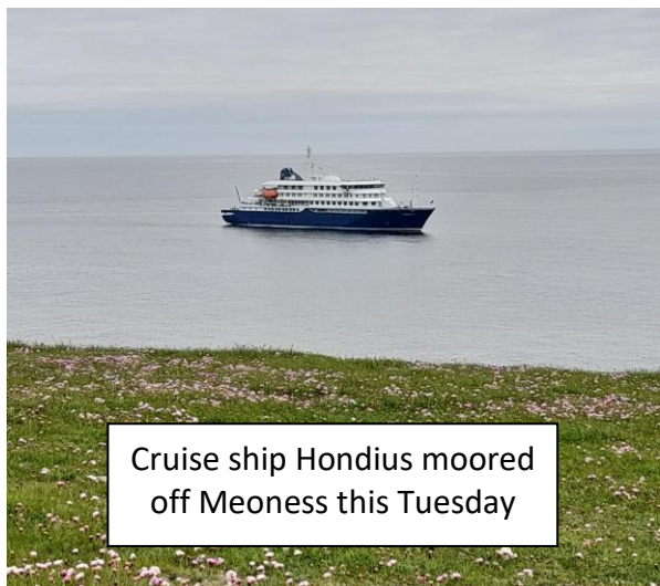
Cruise ship Hondius moored off Meoness this Tuesday