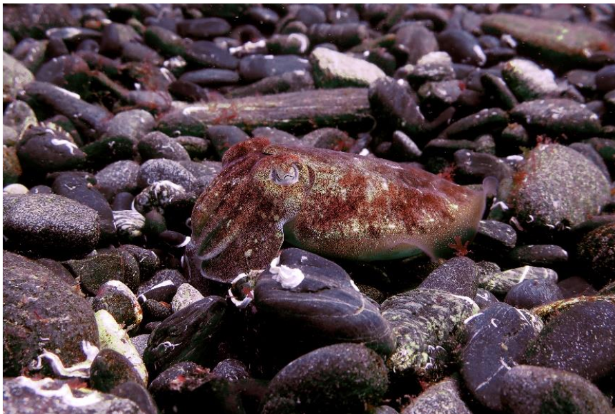
Cuttlefish in Porthkerris, Cornwall, 2020.