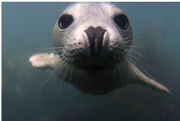
Young grey seal off Lundy, 2021.

What is the hardest thing you do? Also probably SCUBA diving! Not only is the equipment a bit finicky at times, and heavy to lug down rocky shores to get to the fun diving locations, but during my degree I did the HSE ProSCUBA course that gave me a commercial diving licence. It was great fun, but a lot of hard work!