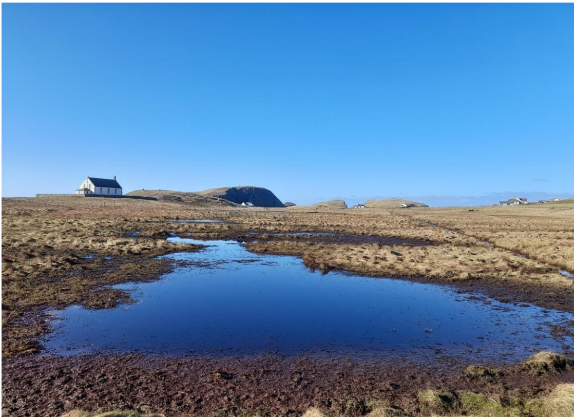
Looking west from the east road, over da Water, with the Kirk, North Shirva, Stackhoull and Lower Stoneybrek from left to right.