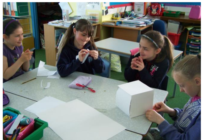
Our completed designs