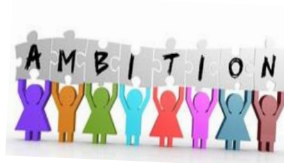
Space Place EYC