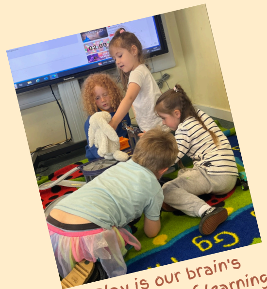
play is our brain's favorite way of learning