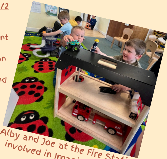
Alby and Joe at the Fire Station involved in Imaginative Play