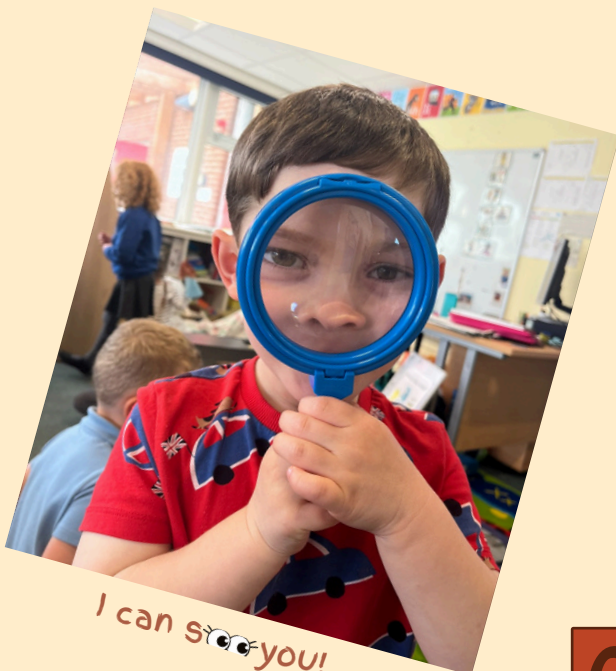
I can see you!