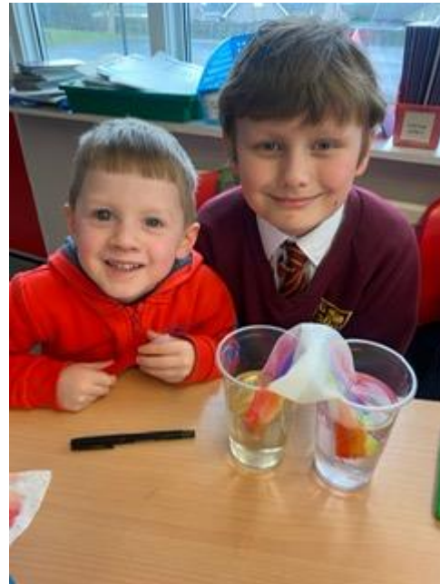
Primary 1s and 7s worked together on experiments