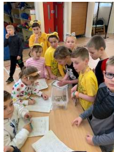
Lots of fun and games