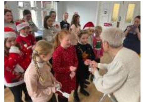
Singing at Fairknowe