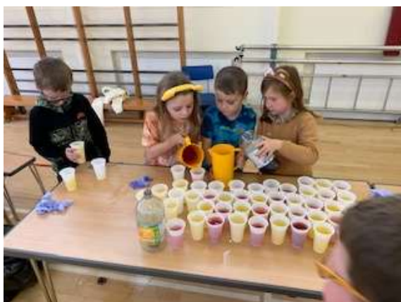
P.3 getting ready for the afternoon