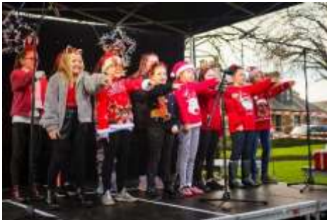
Gardenrose choir at the Greenside

Our choir have been very busy this term entertaining the town. They sang at our Christmas Fair, then performed at the Greenside and then went to Fairknowe to entertain the residents.