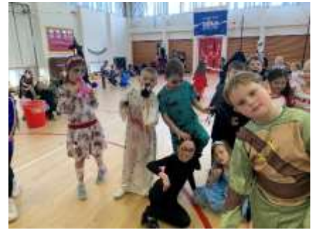
P.1 – 3 Halloween Party