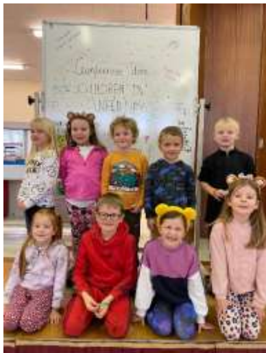
P.2 Pudsey Ready

Primary 3 organised all our Children in Need activities this year and they did an amazing job. There was a fitness session, competitions and the all-time favourite ... soak the teacher. They raised an amazing £656!!