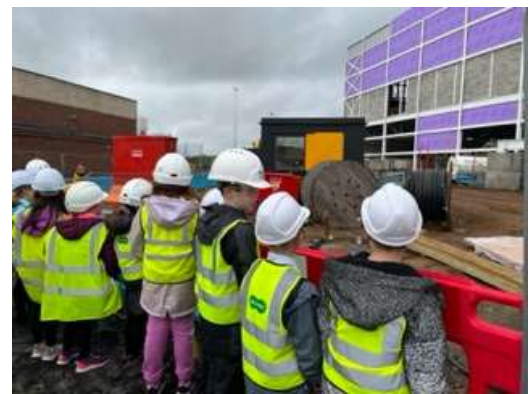
Primary 4 s visit to the new campus

Shortly after our visits, the topping ceremony took place.