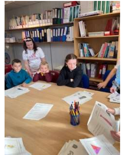
Our Pupil Council sifting through the uniform competition entries