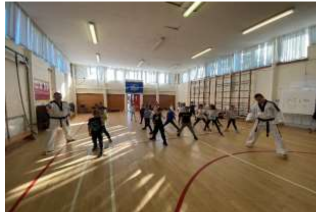
Primary 3's taking part in Taekwondo

We currently have a number of after school clubs operating.