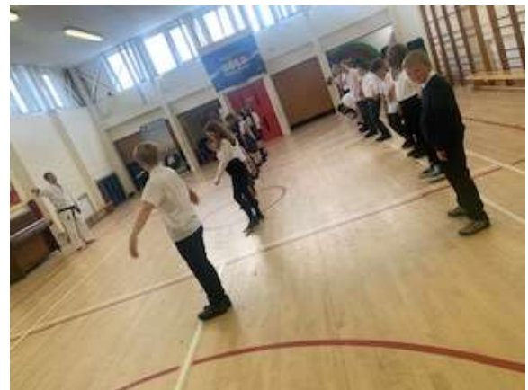
P.4 and P.6 taking part in Karate