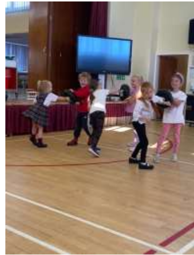
Primary 2's taking part in Taekwondo