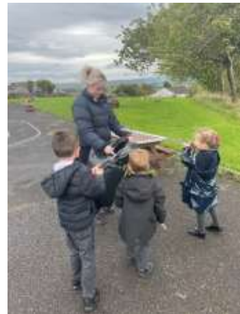
Our new Primary 1s