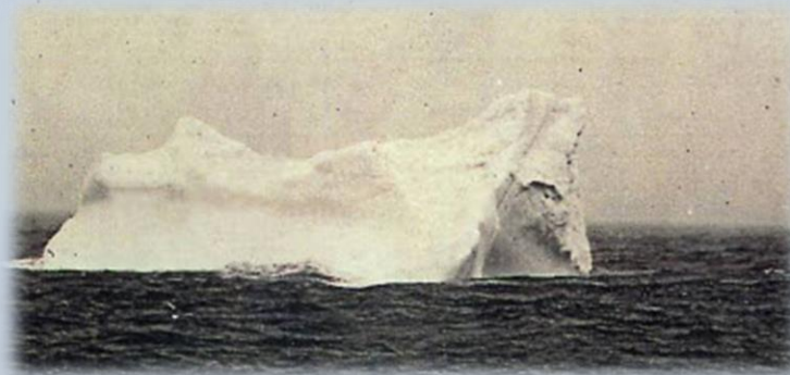
A photograph of the iceberg that the Titanic probably hit.

The warning comes too late. The iceberg was only 600 metres away, and it is too late for Titanic to turn and avoid it. She hits the iceberg. Some people feel and hear the impact.