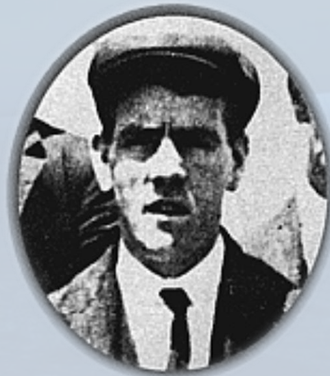
The Lookout - Fred Fleet

The lookout, Fred Fleet notices an iceberg in Titanic's path. He sounds the warning bell and telephones the bridge saying: "Iceberg right ahead!" The iceberg is 18 metres high above the sea. First Officer William Murdoch orders the engine room to stop the engines, and calls "Hard-a-starboard" to the helmsman.