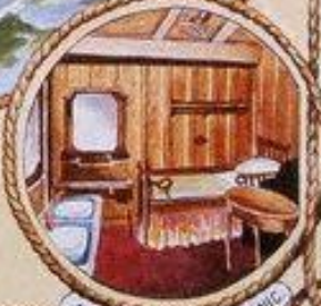
STATE ROOM, R.M.S. TITANIC

provides for her first-class passengers VINOLIA OTTO TOILET SOAP the highest standard of Toilet Luxury and comfort at sea.