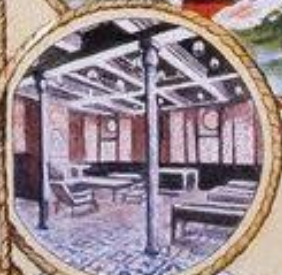
TURKISH BATH, R.M.S. TITANIC