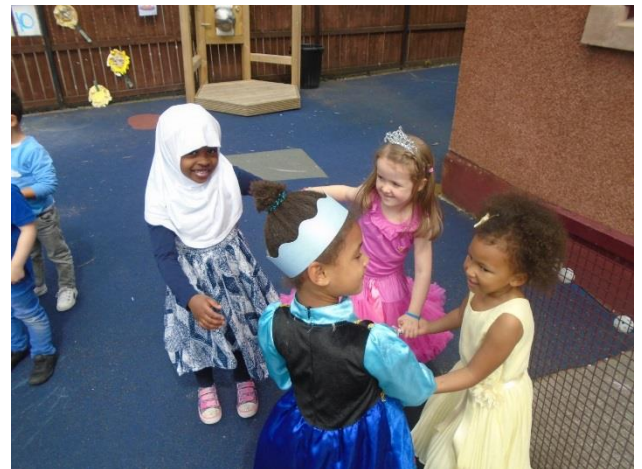
Royal Wedding Fun in the nursery class!