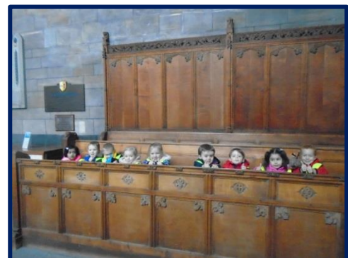
New nursery choir at Paisley Abbey!

As a focus during this week, the children will be learning a new rhyme each day in nursery. These rhymes will be reinforced in nursery in the weeks to follow as this can help the children to develop their language and communication skills. Introducing children to a variety of nursery rhymes can help them learn about different sounds which is an important part of developing early literacy skills.