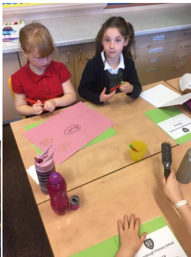
Teamwork to learn about adjectives in P4.