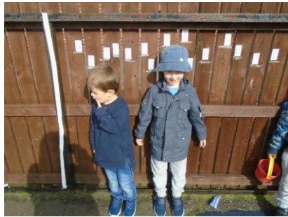
Outdoor fun to learn about measure in the nursery.