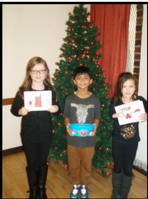
Proud P5 children. Well done folks!

Please make an appointment with your child's key worker. If the designated day is unsuitable, please speak to your child's key worker who will arrange an alternative appointment.