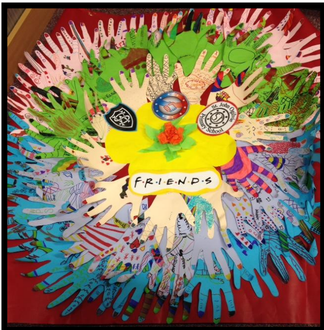
Hands of Friendship by P4