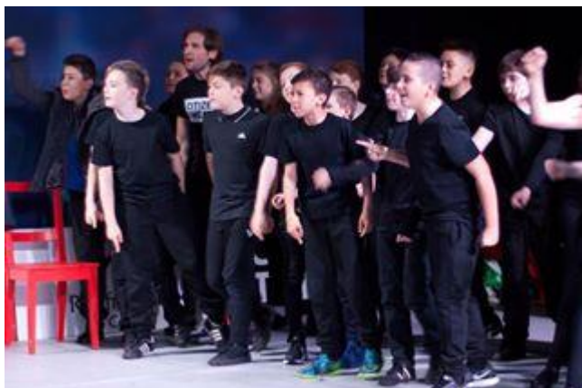
Angry chorus sing "You're not from around here, are you?"