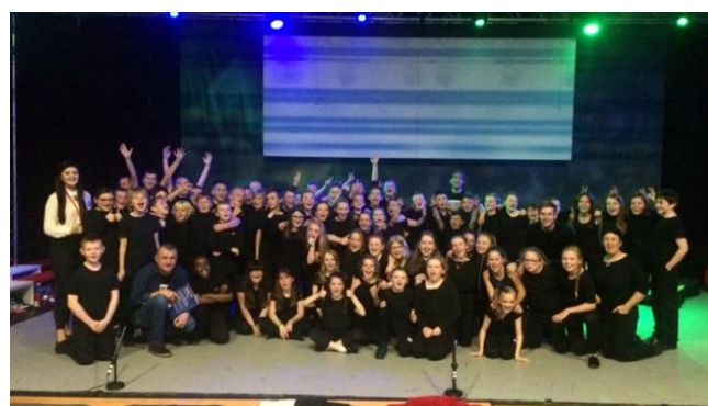
Cast photo – stars of the future!