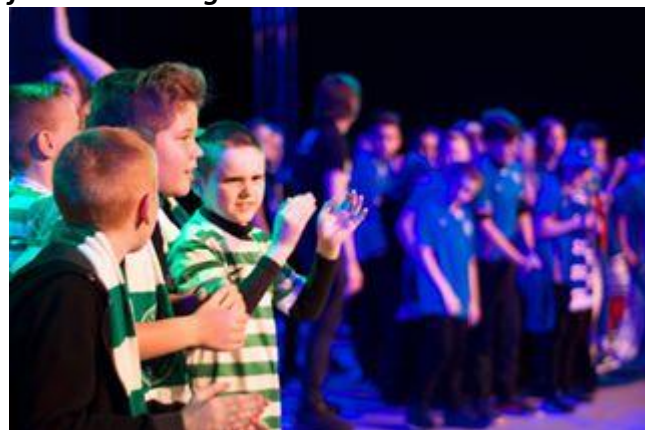
The Old Firm Game.