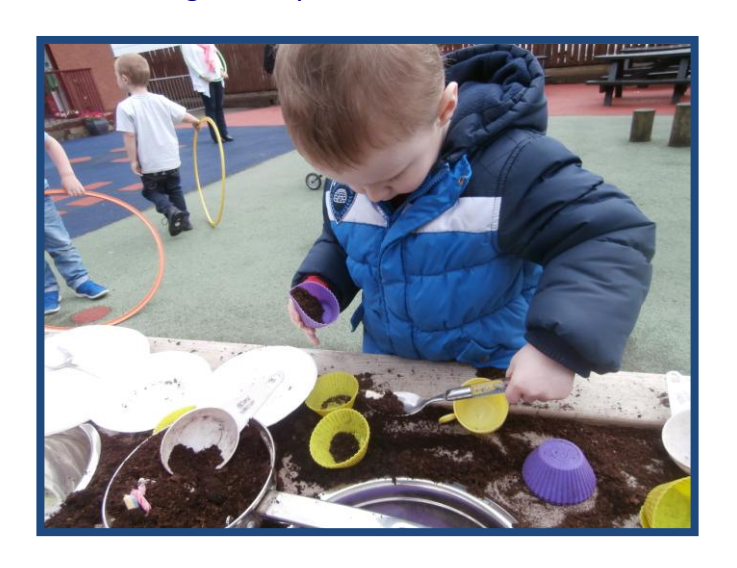
Mixing up a fresh batch of goodies in the mud kitchen!

One suggestion this month related to the provision of storage for scooters, bikes etc. At present we do not have storage within the nursery. Bikes and scooters can be stored at the bike racks within the school playground near to the car park. I appreciate that storage would be preferable within the nursery and this is something we may look into in the future.