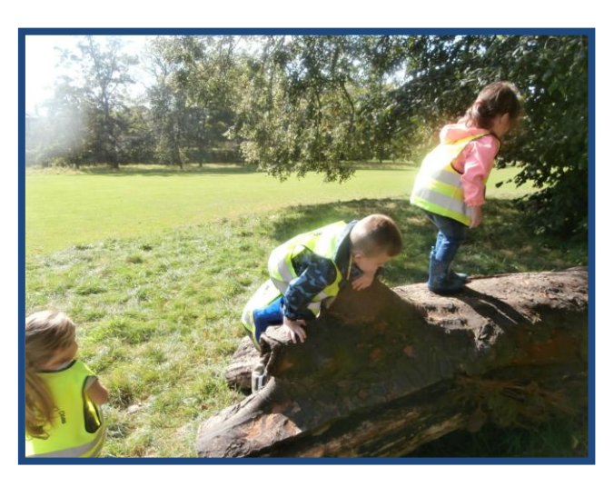
Happy children exploring the outdoors as part of our nursery "Forest Kindergarten" programme.

If your child plays with any outdoor resources prior to coming into Nursery, can you please ensure that these are returned ready for the start of the session as staff will have tidied ready for the next group of children. Your support is appreciated.