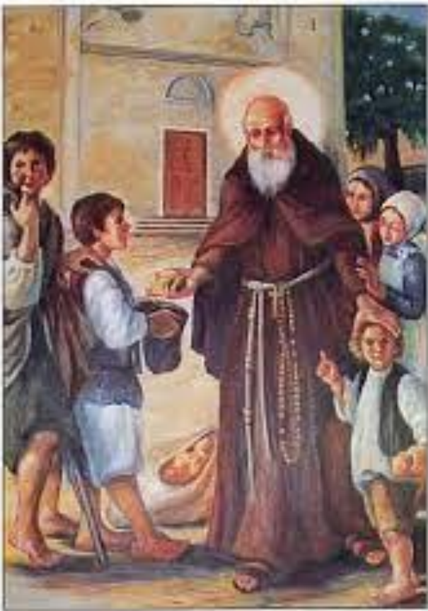
SANT'IGNAZIO DA LÀCONI

Ignatius was the son of a poor farmer in Laconi, Italy. He was born on December 17, 1701. When he was about seventeen, he became very ill. He promised to be a Franciscan if he would get better.