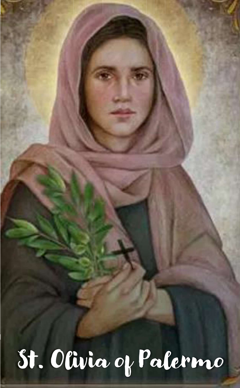
St. Olivia of Palermo

From her early years, St. Olivia she devoted herself to prayer and riches and loved to give charity to the poor. She was so strong and urged the Christians to remain steadfast in their faith. Through the strength of her spirit, seeing that nothing could break her, her family and house, they sent her to Tunis.