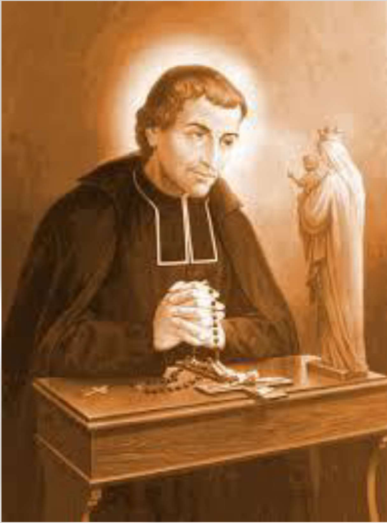
St Louis de Montfort

Louis's life is inseparable from his efforts to promote the Church. Totus tuus ("completely yours") was Louis's motto.