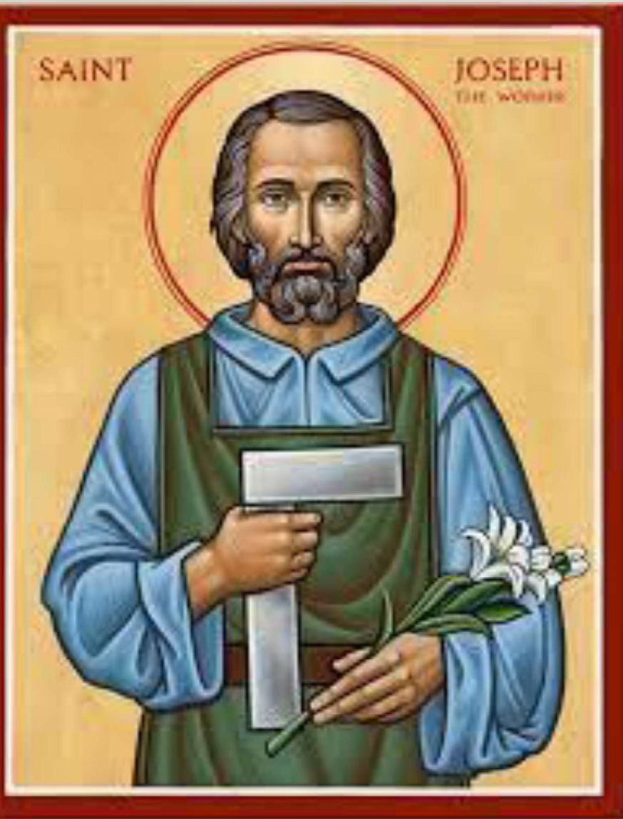
St Joseph the Worker

St. Joseph has two feast days on the calendar. The first is May 1 st , the Feast of the Husband of Mary. The second is May 19 th , the Feast of St. Joseph the Worker.