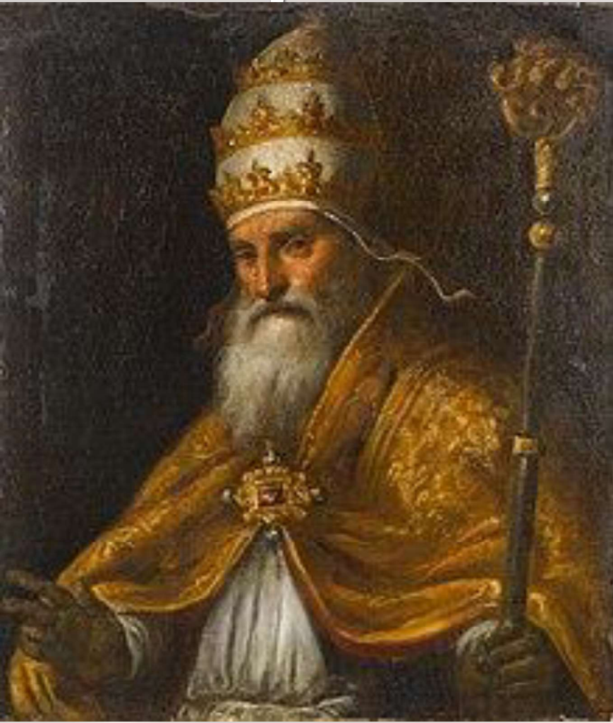
St Pius V, Pope

During his papacy (1566-1572), Pius V took the responsibility of getting a shattered Church of God had been shaken by corruption, the Turkish invasion, and by the bloody wars. His previous pope convened the Council of Trent to address pressing problems. Off and on over the years, he condemned, affirmed, and decided on many things in 1563.