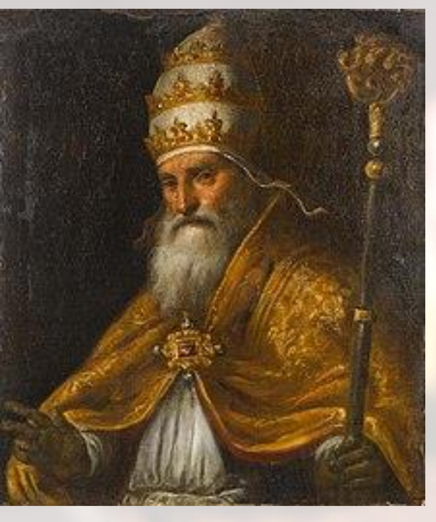
St Pius V, Pope

During his papacy (1566-1572), Pius V was faced with the almost overwhelming responsibility of getting a shattered and scattered Church back on its feet. The family of God had been shaken by corruption, by the Reformation, by the constant threat of Turkish invasion, and by the bloody bickering of the young nation-states. In 1545, a previous pope convened the Council of Trent in an attempt to deal with all these pressing problems. Off and on over 18 years, the Fathers of the Church discussed, condemned, affirmed, and decided upon a course of action. The Council closed in 1563.