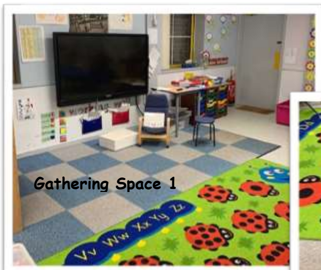
Gathering Space 1