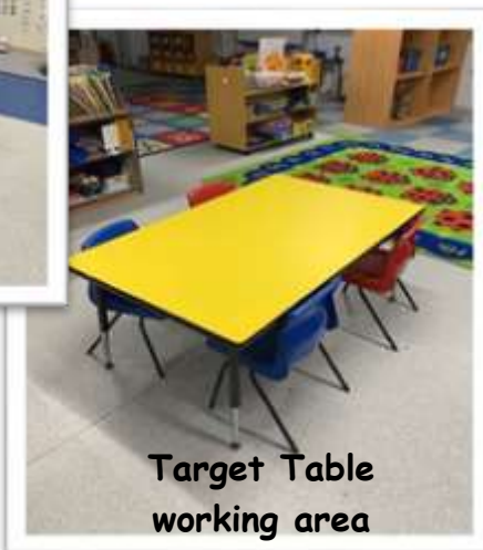
Target Table working area