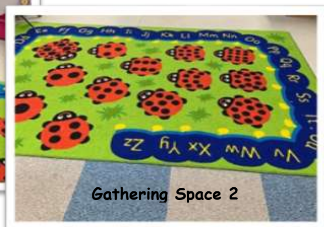
Gathering Space 2