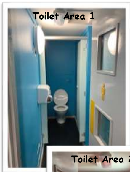
Toilet Area 1