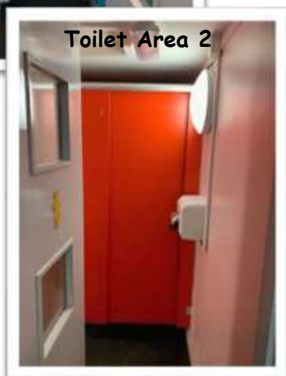
Toilet Area 2