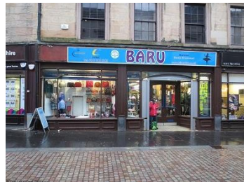
Paisley - Moss Street