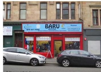
Paisley – West End

Baru have put some measures in place to allow them to safely re-open with an expected date of 1 June 2020 :