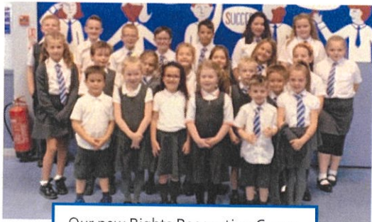
Our new Rights Respecting Group