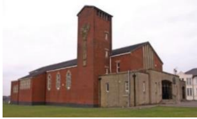
St. Peter's Church, 154 Braehead Rd, Paisley PA2 8NG

A copy of our school review report is available upon request by contacting me directly at the school office. I am so pleased to say it was an extremely positive visit with the hard work of our staff team and wonderful children being recognised. A highlight for our school was that our community ethos shone through and was discussed positively by our parents who met with our review team. The team from Renfrewshire Council found that relationships in our school were caring and respectful and they commented on the commitment of everyone to providing consistently positive learning experiences for all our children. Thank you to everyone who worked so hard to make this a successful achievement for St. Peter's Primary School and Early Learning and Childcare Class.