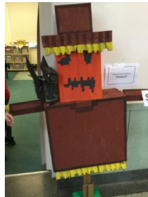
Our winning scarecrow from primary 5 – Minecraft

Well done to primary 5 who created a wonderful Minecraft scarecrow and were the winners of our school competition. The scarecrows across the school were absolutely wonderful and the atmosphere on the day was tremendous as children made their way around (at their designated time) to view all of the creations made by each class. The children developed so many creative teamwork skills throughout the process. This will definitely be an annual event as there was lots of learning taking place and so much fun had by all.