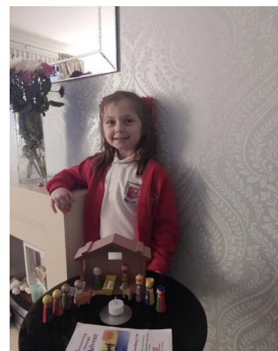
April with the Travelling Crib at home.