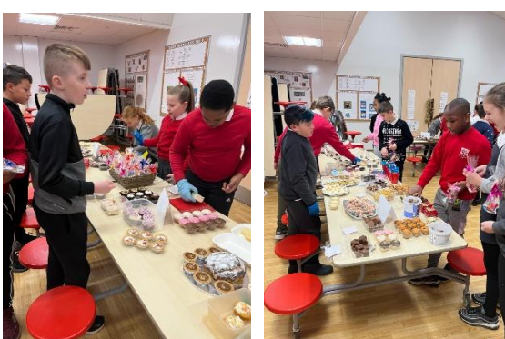
Photograph: Top left - Anchor 6 enjoyed wearing their christmas jumpers to school. Top right - Our lovely dinner ladies getting in the festive spirit. Bottom left - P1 & P2 showing off their jumpers. Bottom middle and right: Cake and Candy sale.