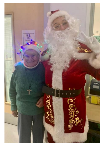
Photograph: Santa and his Elf visited St Paul's for their Christmas Fayre. Lots of very good children visited him.

It was fantastic to have our Christmas Fayre back! There were lots of different stalls available including our favourite hotdog stall. There were some Christmas inspired crafts stalls, where lots of people were able to do some early Christmas shopping. We had a Santa's Grotto, where children could see Santa and his friendly, helpful elf. Each class worked hard to make brilliant and beautiful crafts to sell to friends and family. The cakes and biscuit stalls were particularly yummy. Tombola and toy tombola were a real hit. It was nice to see lots of people in the community come together to help raise money for the school.