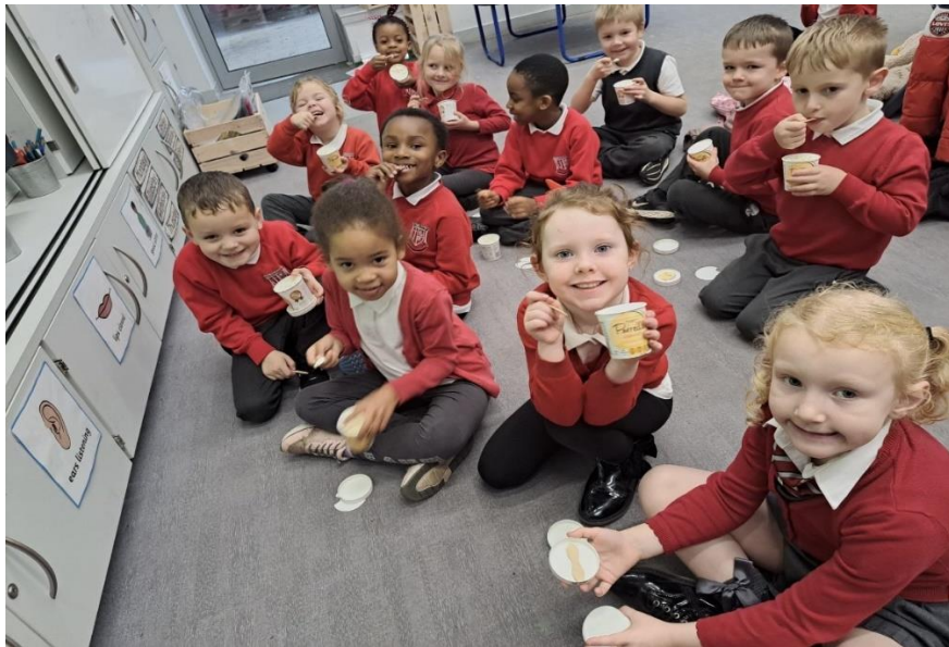
Photograph: Primary 1 enjoying their ice cream before the show.