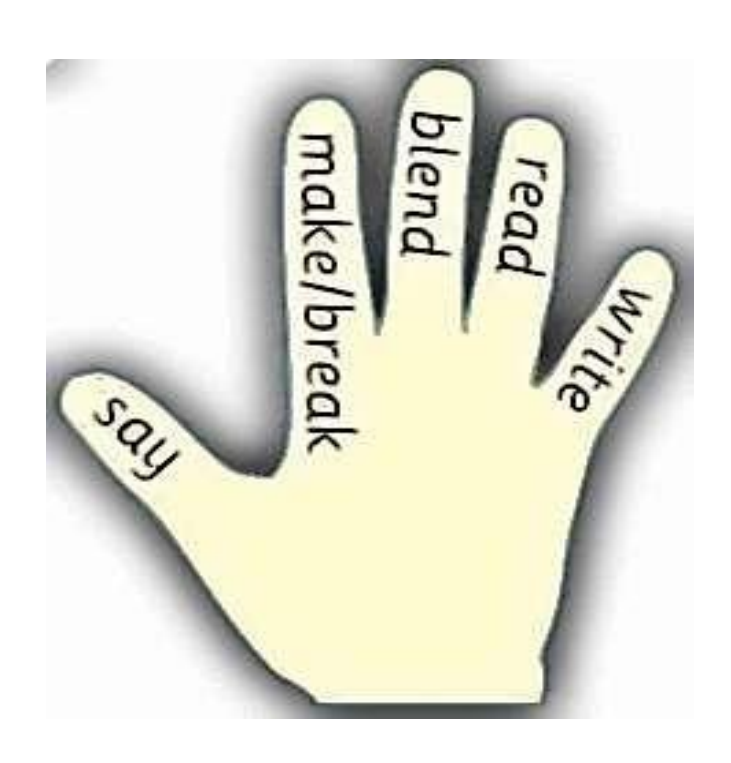
Example use of the Five Finger Strategy – 'train'