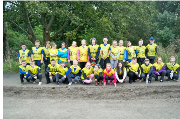
Forest Schools outdoor cross-curricular topic

The action plan was linked to the school curriculum through many curricular areas, including social studies, maths, literacy, science, and health and wellbeing. One example of how a specific class linked all three topics to the curriculum is primary 6 participated in a 6-week outdoor learning topic named ‘Forest Schools’. They were awarded the John Muir award and Action Earth certificates for making a positive change to the school’s local community.