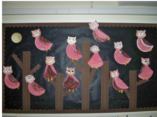
Perfect Pandas and Owls by Primary 1