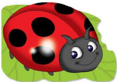
Ladybird Room 2-3 years

In addition to this, a limited wraparound service is offered between 11.50-12.40, subject to availability and at a cost set by the council of £3.85 per hour. Wraparound care for the children of parents who are working or in training is available term time only. Proof of working hours or attendance at training is required for allocation of a wraparound place.