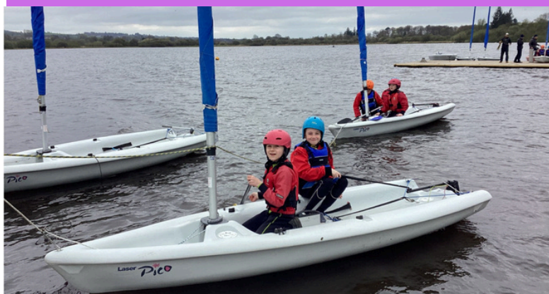
P6 visited Lochwinnoch for a full day sailing experience earlier this month.

https://blogs.glowscotland.org.uk/re/fordbankprimaryschoolren/