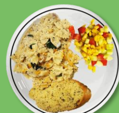
Creamy Pesto Pasta (v) With Garlic Bread (ve)

Veg & Rice or Lentil Soup (ve) Optional: with Bread (v)