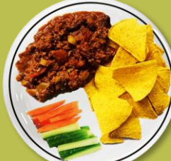
Quality Meat Scotland Mexican-Style Beef Chilli With Nacho Chips (ve)