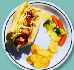
Red Tractor Meatball Sub Melt with Sauté Potatoes (ve)

Tangy Tomato Soup (ve) Optional: with Bread (v)