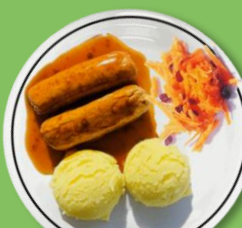
Quorn Bangers in Onion Gravy (ve) with Mashed Potato (ve)