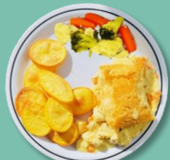
Red Tractor Homemade Chicken Pie with Sauté Potatoes (ve)