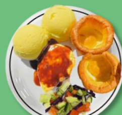
Red Tractor Roast Chicken Fillet with Yorkshire Puddings with Mashed Potato (ve)