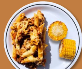
Quality Meat Scotland Beef Bolognese Pasta Bake