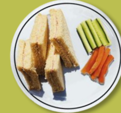
Red Tractor Ham Sandwich