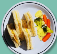
Cheese Sandwich (v)

Fruit Salad (ve) & Fresh Fruit Selection (ve)