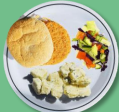
Plant-Power Crispy Burger in a Bun (ve) with Potato Salad (v)

Carrot & Coriander Soup (ve) Optional: with Bread (v)