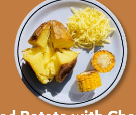
Baked Potato with Cheese (v)

Delight Dessert (v) & Fresh Fruit Selection (ve)