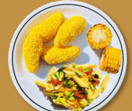
MSC Fish Goujons With Pasta Salad (v)

Leek & Potato Soup (ve) Optional: with Bread (v)