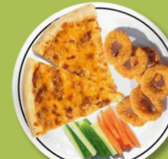
Margherita Pizza (v) with Onion Rings (ve)

Seasonal Harvest Soup (ve) Optional: with Bread (v)