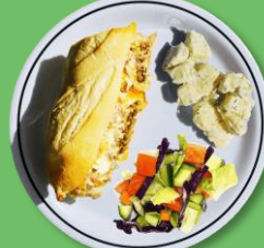
Tuna Melt Panini with Potato Salad (v)

Fruity Yoghurt (v) & Fresh Fruit Selection (ve)