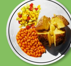
Baked Potato with Beans (ve)

Cook's Choice of Home Baking (v) & Fresh Fruit Selection (ve)