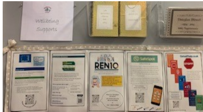
Our Well-being Support Wall in our Family Room