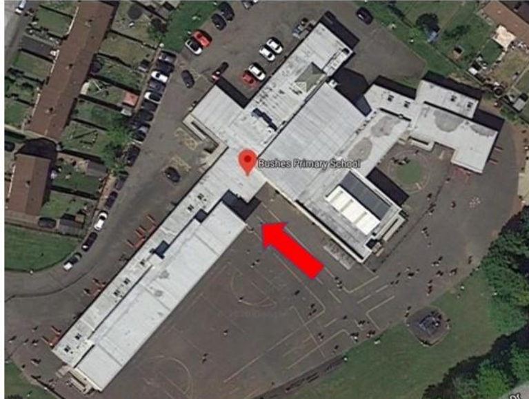
8.50am and 2.50pm P5/6