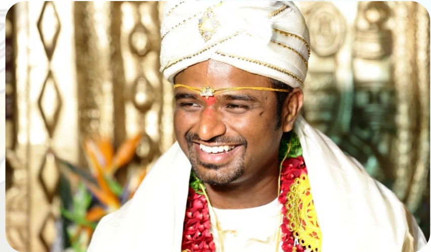
Photo courtesy of Shashank Mhaswade (@flickr.com) - granted under creative commons licence – attribution