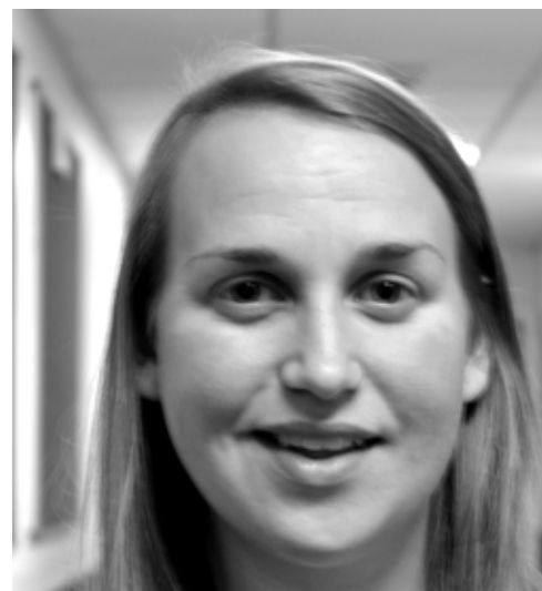
Miss Day Geography