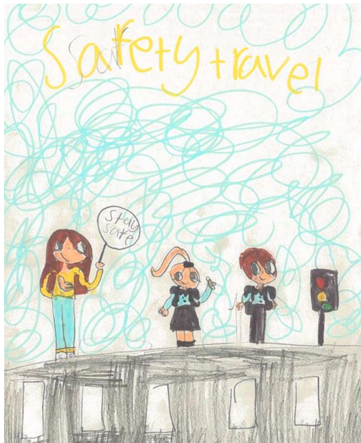
Cover Picture by Amelie Millar P4, 2025