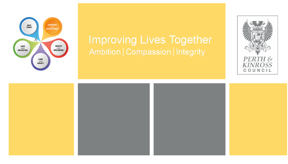
Pupil Absence from Learning