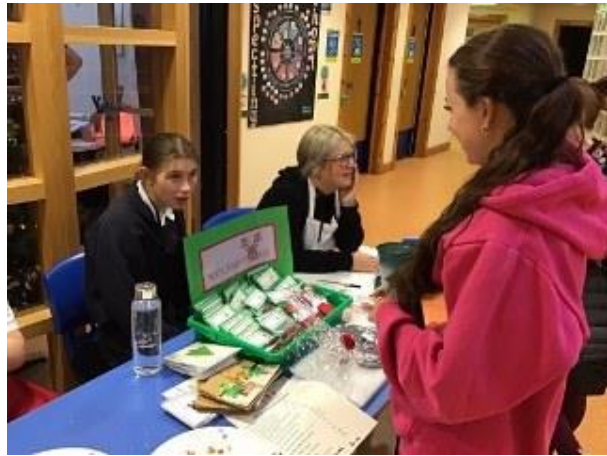
Room 6 also created the quaintest Santa Stockings with chocolate inside.