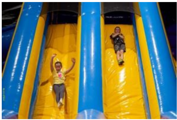
Work experience and further family opportunity