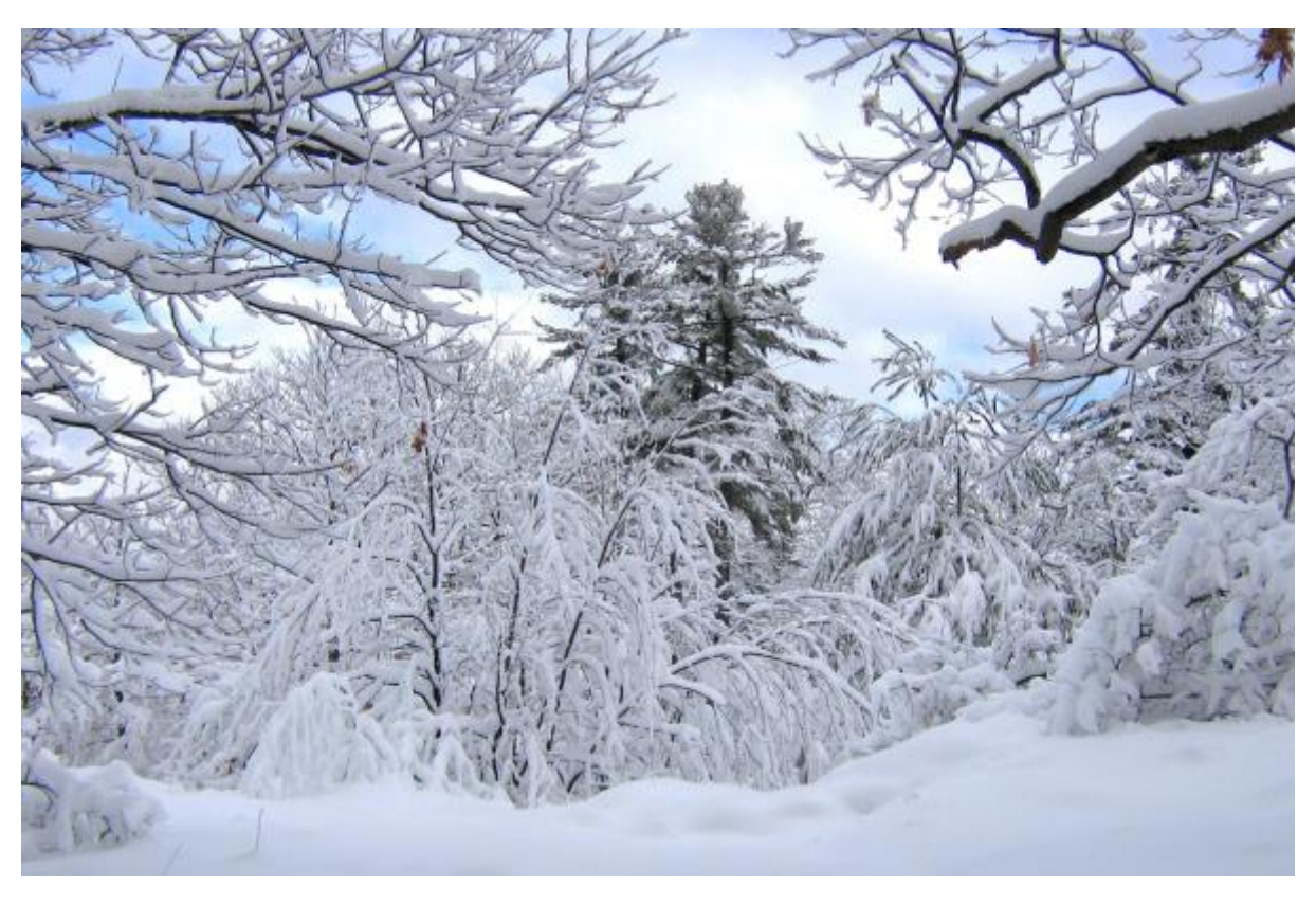
It is important parents/carers are aware of the winter weather procedures we adhere to.