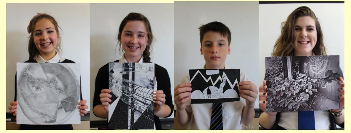
Some of the pupil's work that was selected for the printed Anthology.