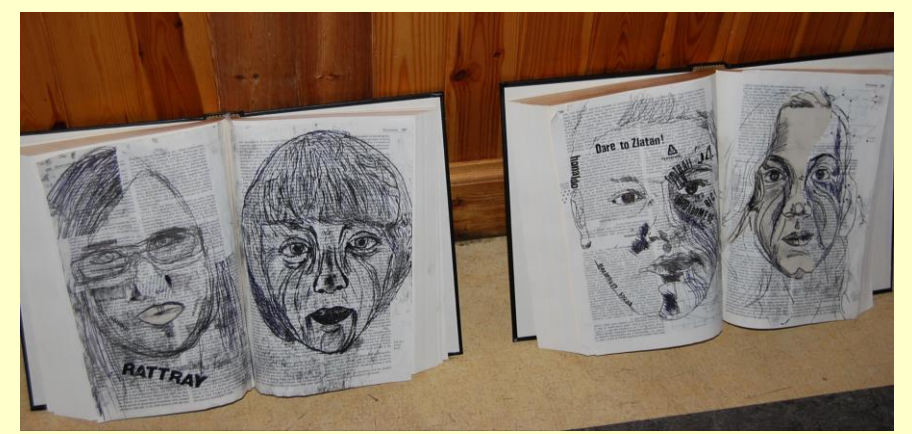
S3 Mono-print S3 portraits printed onto book pages.