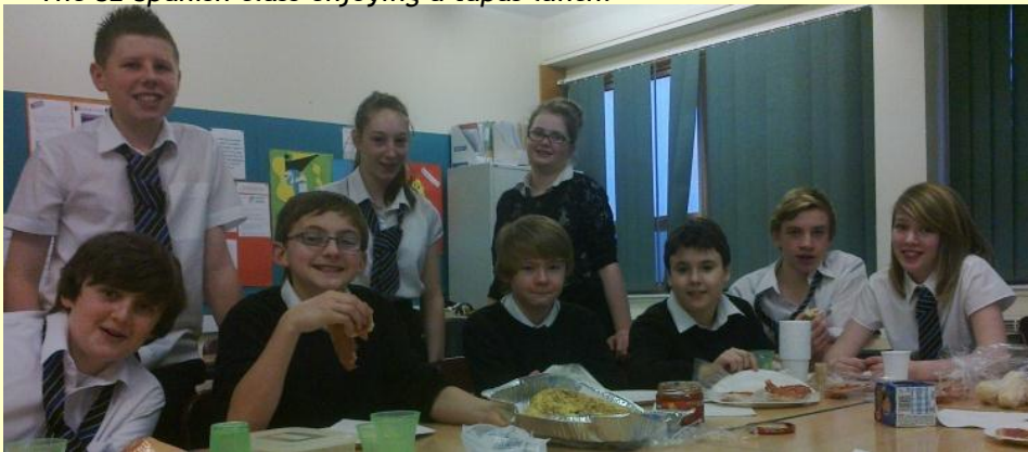
The S2 Spanish class enjoying a tapas lunch.

Here's some Spanish vocab. Can you use it to help you match the sentences in English and Spanish below?