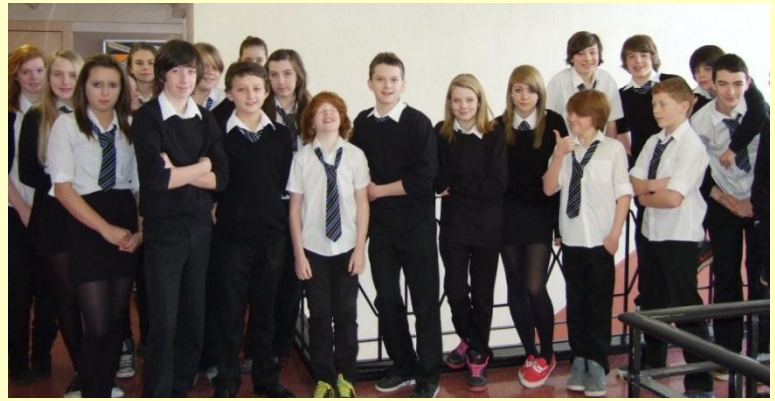
Some of the 60 S2 pupils who went to see 'Great Expectations' with the English Department

On Friday the 7 th December we went on a trip to the cinema to see the film adaption of the classic Dickens novel 'Great Expectations'. The film was dramatic and captured the sense of excitement portrayed in the original novel. Helena Bonham Carter played the eccentric Miss Havisham and Pip was played by "War Horse's" Jeremy Irvine. It was great to have a nice day out with friends and we would all like to say thank you to the teachers in the English department who organised the trip for us.