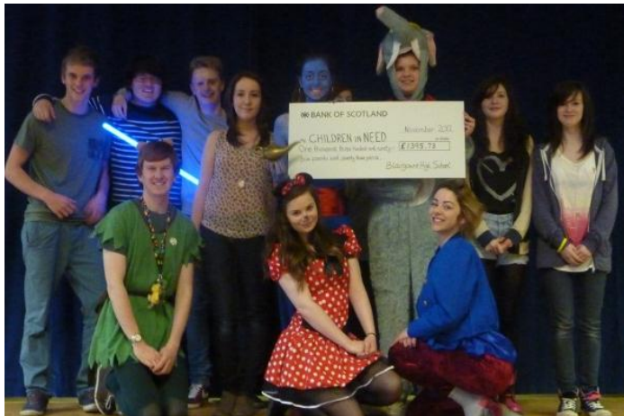
Senior "superheroes" presenting a cheque for £1400