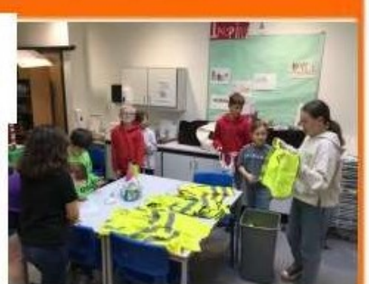
J.R.S.O.s leading safe travel for Evie.