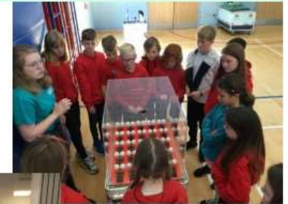
Glasgow Science Centre - Electricity