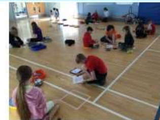
Coding with Silicon Craft - OISF