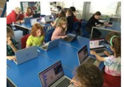
Measuring, Shapes and calculating with robots