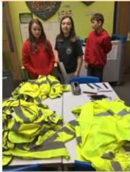
P7 Junior Road Safety Officers