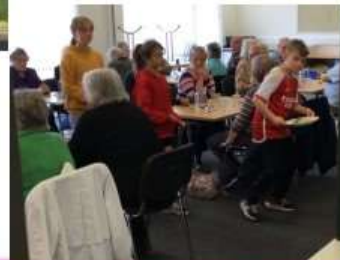
Serving our Over 60s in the Community room.

Ethos and life of the school as a community