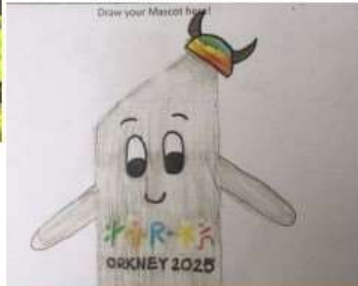
Mascot design for Orkney Inter island games 2025