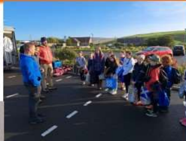
P6 Outdoor Education