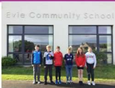
Primary 7 Buddies for P1 this term