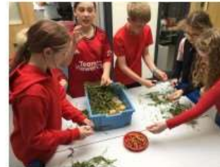
Growing, harvesting and sharing food crops