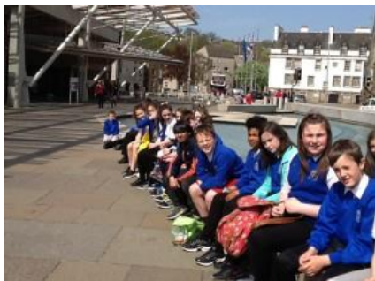
Outside the Scottish Parliament

Primary 7 had a fabulous activity week! It was a fun-filled week with lots of exciting, new things to have a go at. They tried their hand at trampolining, sledging and a climbing wall amongst other activities. They visited Soar at Intu Braehead, Dynamic Earth, the Scottish Parliament and M & D's to name but a few. They certainly got about! We hope they all take some fantastic memories of their time at Primary school with them to high school.