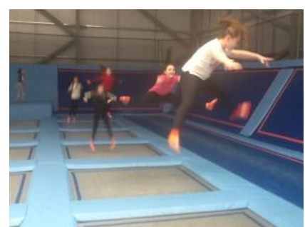
Bouncing fun at Airspace!

If you wish to contact the school and feel that an email is appropriate please use our enquiries email address which is checked on a daily basis. Our address is enquiries@whitelees.n-lanark.sch.uk .