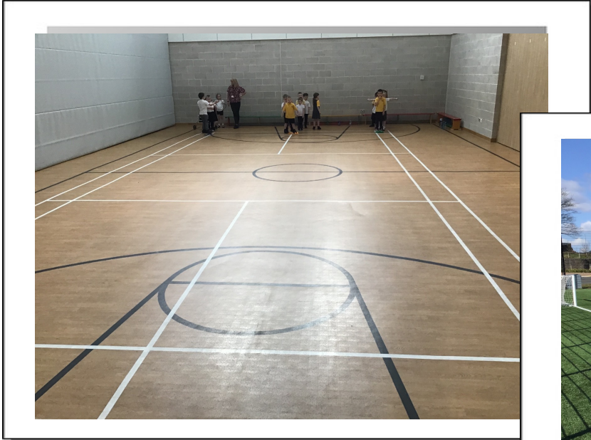
The Gym Hall

Two times per week we will get ready to go to PE. Sometimes this is in the Gym Hall, sometimes this is on our outdoor pitches and sometimes we go to the playground.