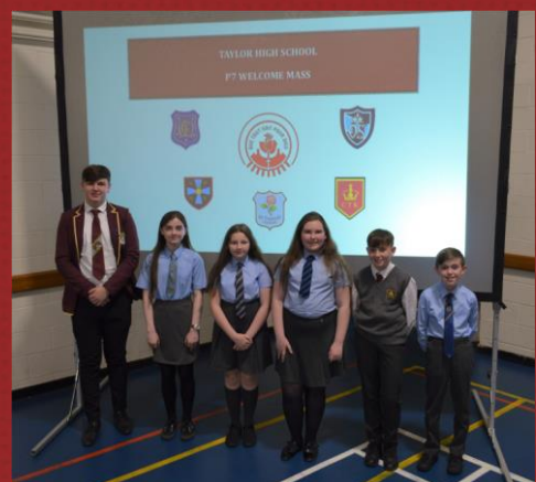
P7 WELCOME MASS