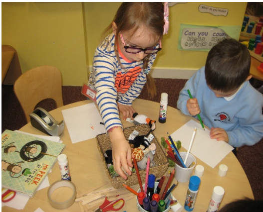
Exploring events and characters in stories

Christmas and New Year seem like distant memories now. We are delighted that the children have thrown themselves back into Nursery life and our new starts are settling in well. Although it's been a long, cold, rainy January, we've been having lots of fun in Nursery.