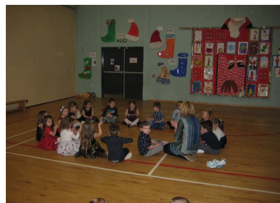
Festive Fun at the Christmas Party