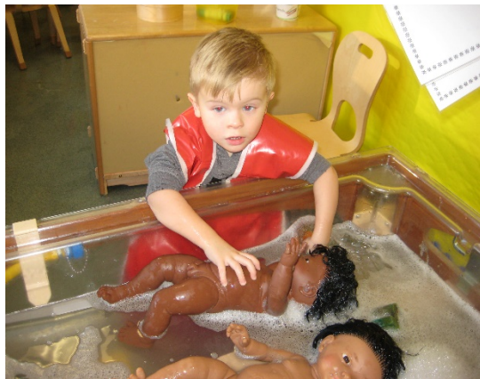
Caring for babies