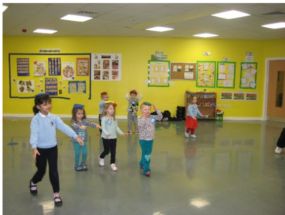
Tae Kwon-do Tigers in action