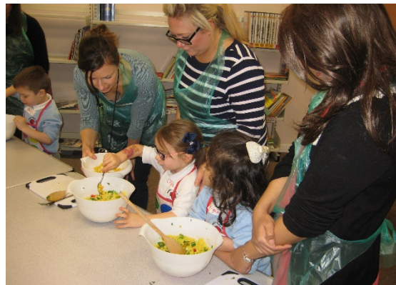
Big Chef, Little Chef