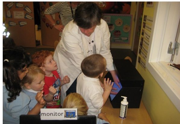
A visit from the Germ Buster