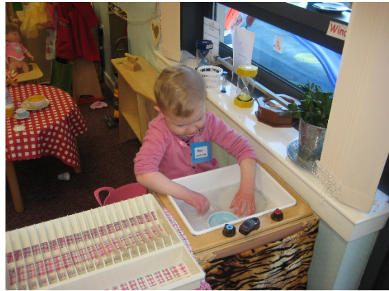
Role play in the home corner