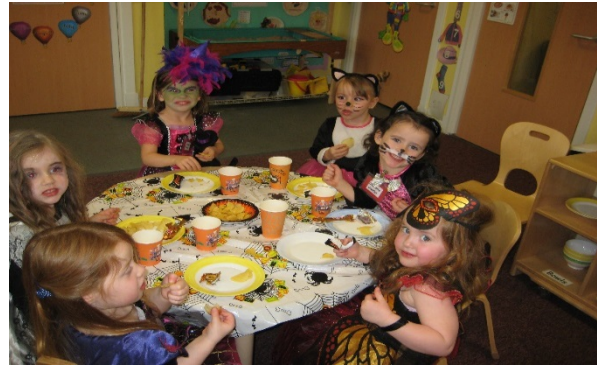
Halloween Party Fun